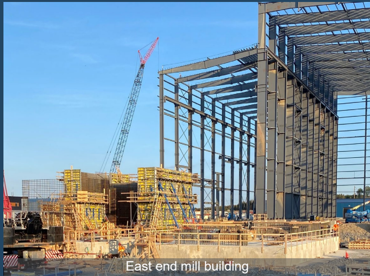
East end mill building