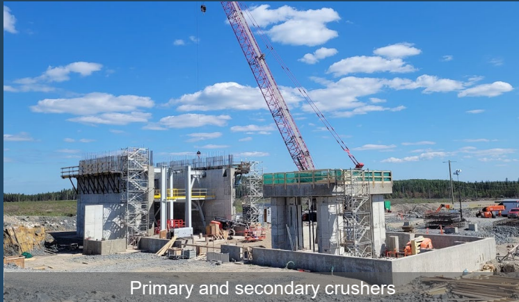
Primary and secondary crushers