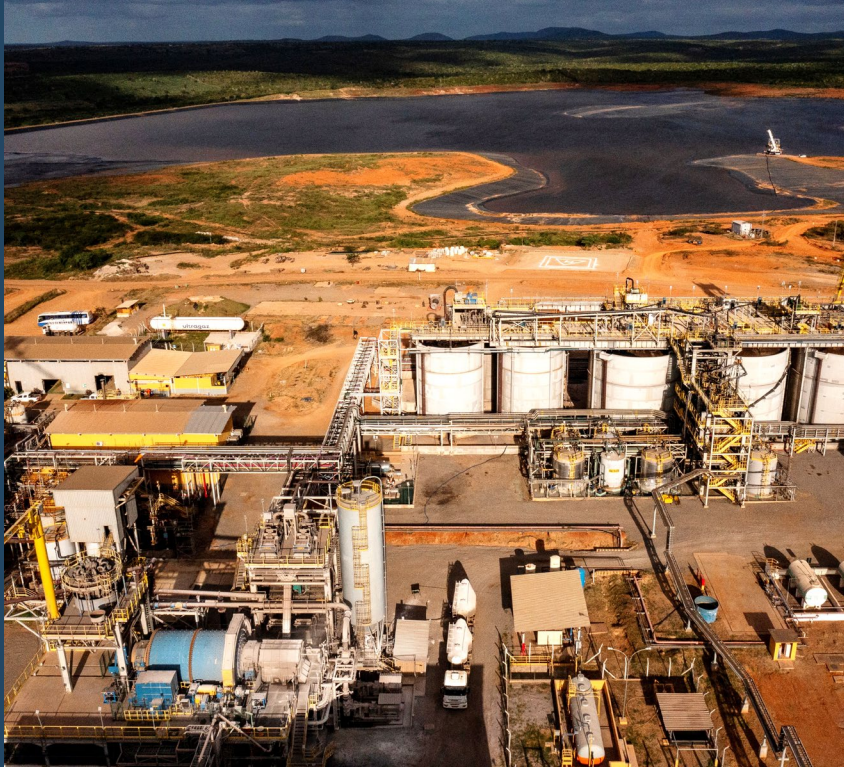
First gold pour, March 30, 2022